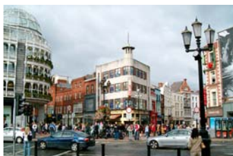
Grafton Street, Dublin

Ireland is the location for the 2009 study abroad program sponsored by Central Michigan University's Department of Educational Leadership. The department offers graduate programs geared toward the development of educational leaders for higher education and P-16 schools. To build the capacity of future educational leaders in relation to global citizenship and the development of culturally responsive educational programs and practices, the department has made a commitment to offer students an opportunity to participate in a study abroad program designed for this purpose. Students enrolled in the study abroad program will take EDL 652 Global Studies or EDL 750 Professional Studies, courses specifically designed for students to study educational systems in an international context.