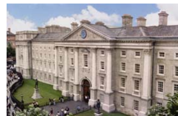
Trinity College, Dublin

During this trip student experiences will include a three night stay at Trinity College in Dublin, a very diverse city in recent years. Students will witness firsthand the challenges facing this nation, where new immigrants from Eastern Europe arrive daily. They will have the opportunity to explore Dublin, attend a play at the renowned Abbey Theater, visit several universities, and an urban school. Travels to Belfast in Northern Ireland offer students a unique historical perspective. Students will participate in a walking tour guided by former prisoners of the Irish Republican Army (IRA) and will learn what conditions in Belfast were like pre 1997 and what they are like currently. Students will visit the educational leadership department at Queen's University in Belfast and a local school either in Belfast or Donegal. In Donegal students will explore an Irish Gaeltacht area. These areas are established by the Irish Government to preserve the Irish language and culture. Preserving the culture is critical to a changing nation and students will gain insight into government policies and practices dedicated to this purpose. Finally, students will spend time on the scenic western coast with visits to Doolin and Galway and participate in cultural experiences unique to the area.