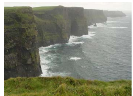
Cliffs of Moher, Doolin, Ireland