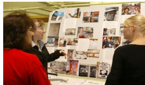
SRACE Exhibition April 2006